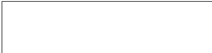
DIAGRAM OF ROOF SYSTEM

6" GUTTER AVAIL IN WHITE ONLY 4" CLAY AVAIL w/ DRIP EDGE ONLY