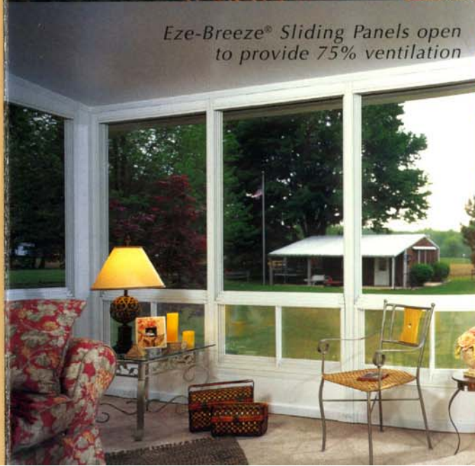
Eze-Breeze® Sliding Panels open to provide 75% ventilation